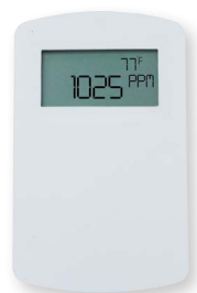
North American Style